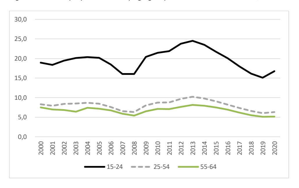
Figure 1.1. Unemployment rates by age groups between 2000 and 2020, EU27 average.